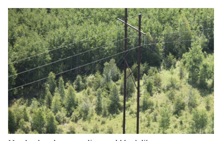
Here's what the power line could look like.

Also, let us know if there are additional ways we could make it easier for you to get involved and share your feedback.